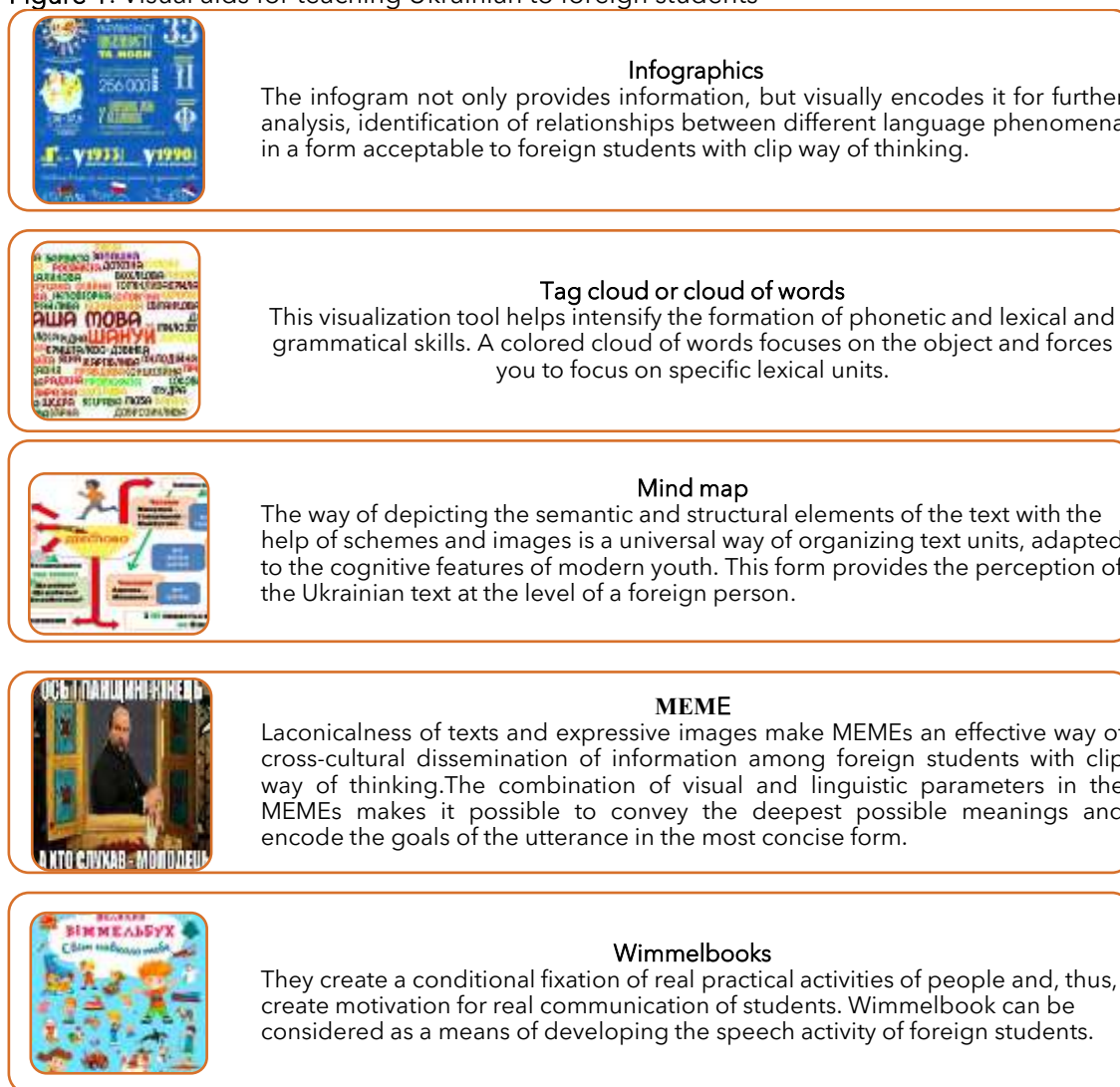
Figure 1. Visual aids for teaching Ukrainian to foreign students

In order to conduct an experiment of teaching Ukrainian language to foreign students with clip way of thinking, the following means were chosen, namely: infographics, word clouds, mental maps, memes, wimmelbooks (see Figure 1).