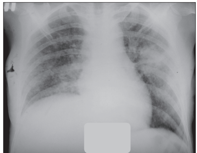
Figure 1. Plain chest radiogram of the patient

And 3 days before hospital admission to ZRTBCD, the patient complaining of fever and dyspnea visited a general practitioner. As a result, she was hospitalized to the Central District Hospital at the place of residence. After further examination, HIV test was positive and plain chest radiograph showed the following changes (Fig. 1): in both lung fields, predominantly in the middle